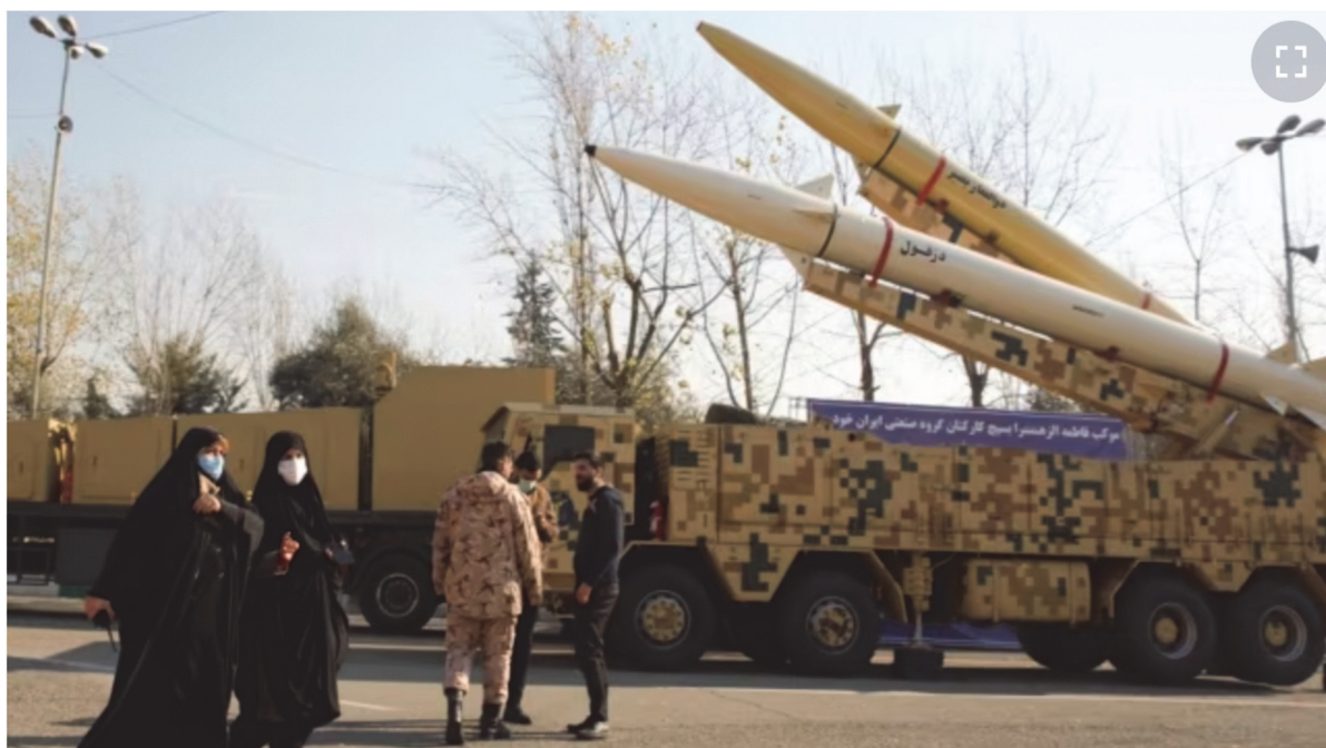
Zolfagha and Dezful missiles 74

It is possible that the Russian armed forces could use Iskander launchers for the Fateh-110 missile. However, the Zolfaghar missile is fundamentally different from the Russian 9M723 and 9M728 ballistic missiles for the Iskander tactical missile system. The main difference is that it has a warhead that is separated from the upper stage. The situation is the same in other respects: without Iranian launchers, the launch of these missiles will be deemed problematic 73 .