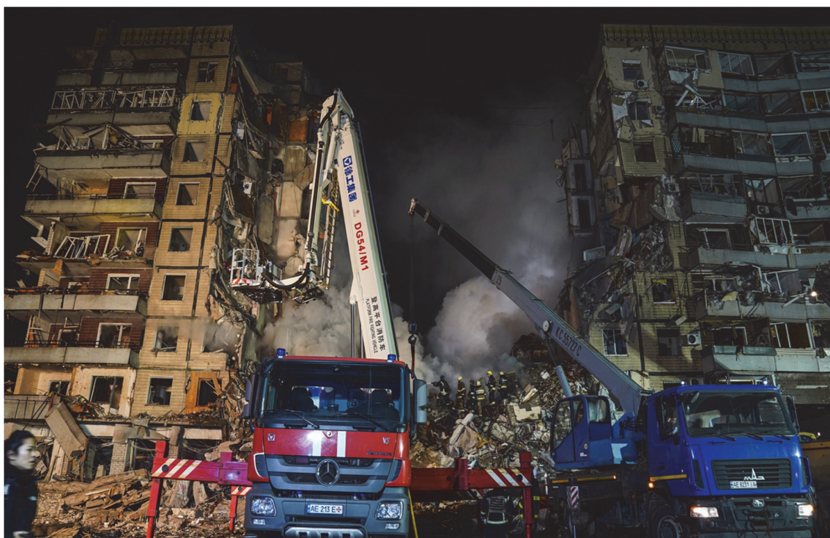
Dismantling of the ruins of a house after a rocket attack by the Russian Federation in Dnipro, January 14, 2023. 62

On January 14, 2023, an Kh-22 cruise missile fired from a Tu-22m3 bomber over the Kursk region near the border with Ukraine struck a multi-story residential building in Dnipro. Forty-six people were killed, 80 were wounded, and 9 went missing. According to the investigation, the bodies of the missing persons were vaporized by the high temperature and poisonous fuel of the Kh-22 missile 61 .