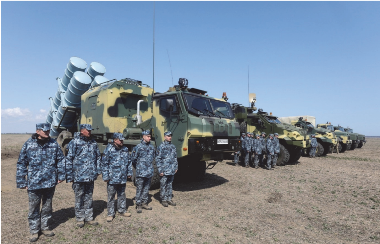
Division of the RK-360MC Neptune complex

of seeing and engaging a target at a distance of 50 km. It is resistant to enemy radar interference.