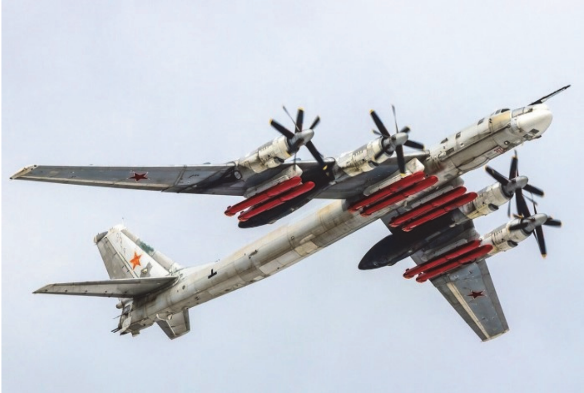
Strategic Russian bomber TU-95 with X-101 missiles on external suspension 116

Thus, the Kh-101 strategic cruise missile (5,500 km) is a modern means of striking targets with high accuracy. Ukrainian air defense systems show satisfactory results in destroying them. Most of all, Kh-101 missiles are used by the Russian-terrorist forces not to hit the targets of the Armed Forces of Ukraine, but civilian infrastructure, causing civilian casualties.