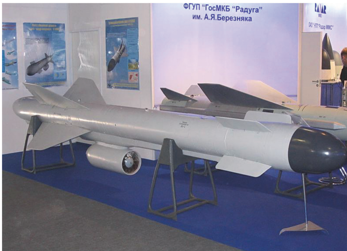
Kh-59MK2 missile, illustrative image 33

59MK2 missiles have already been shot down by Ukraine's surface-to-air defense systems 32 .