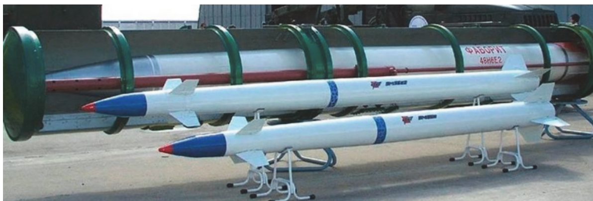
Missiles 48N6E2, 9M96E and 9M96E2

The 5V55K missile is radio-controlled. It weighs up to 1,500 kg and is equipped with a 133-kilogram warhead. The 5V55R and 48N6 missiles with a warhead weighing up to 144 kg are also used. It should be noted that Defense Express in a separate article described in detail the capabilities of the S-300 in terms of strikes on ground targets, which, in their opinion, are ineffective due to the unsatisfactory accuracy of target engagement. Nevertheless, as a terrorist weapon against the civilian population, the missiles are causing a lot of harm to the Ukrainian people. According to media reports, the S-300 receives its coordinates from the Army's reconnaissance divisions. Belarusian media claim that the S-300 uses the target coordinates set before launch to guide the onboard inertial system. The coordinates can be updated during the flight via a radio channel. In the final phase, the missile uses semi-active radar homing to reach the target. S-300s were used to strike the ground targets in Luhansk, Donetsk, Kherson, Zaporizhzhia and Mykolaiv regions of Ukraine 37 .