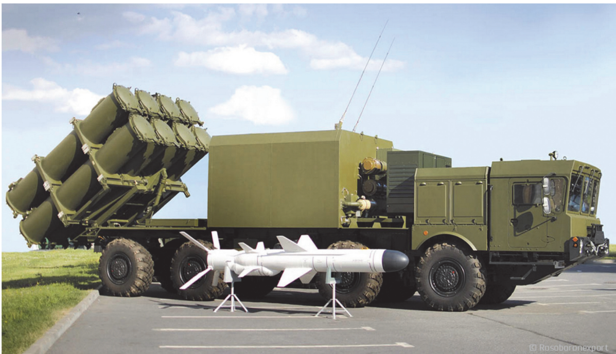
Bal coastal missile system with X-35 missile 76

The newest anti-ship missile, the Kh-35 Zvezda (Product 78, 3M24; NATO code AS-20 Kayak/SS-N-25 Switchblade), is a Russian turbojet subsonic cruise missile. It can be launched from airplanes, helicopters, surface ships (3K24 Uran missile system) and shore-based mobile missile systems (3K60 Bal, NATO code SSC-6 Sennight). It is designed to destroy ships with a tonnage of up to 5,000 tons. Shipboard and shore-based versions are launched using a launcher. It has been in service since 2003 75 .