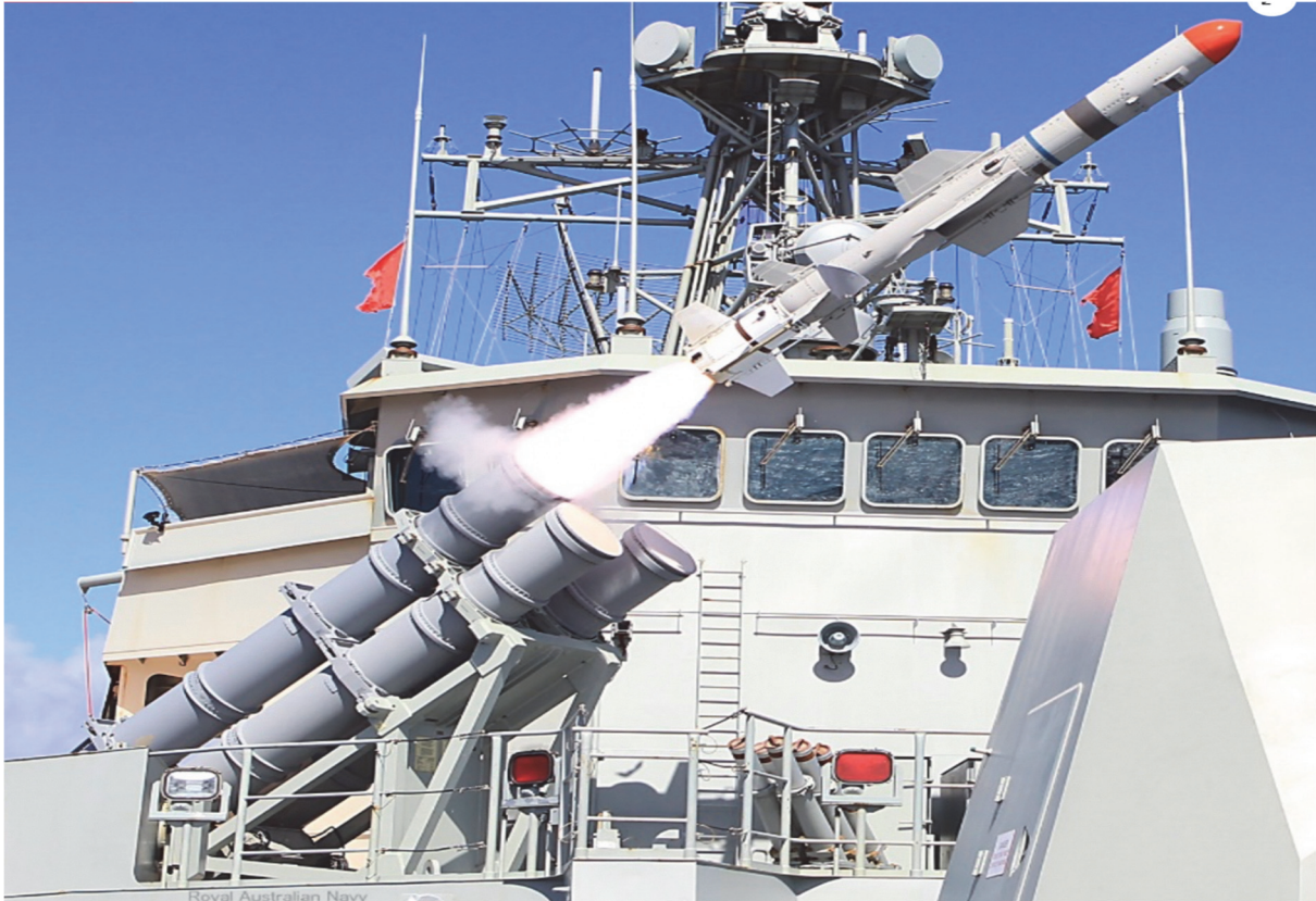
Harpoon launch from the Mk-141 launcher from the Royal Australian Navy ship HMAS Warramunga 83

flight path. To protect against electronic warfare systems, it has a hopping operating frequency that changes in a random pattern. On the initial and marching (sub-adult) sections of the trajectory, flight control is carried out automatically using a navigation system, radio altimeter and digital computer.