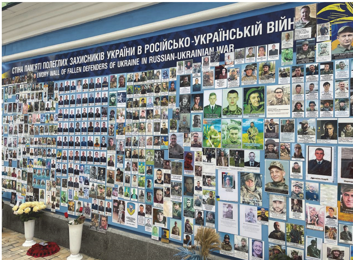
A part of the wall of St. Michael's Monastery (Kyiv) in memory of fallen defenders of Ukraine in the Russian-Ukrainian war

According to Ronald Reagan, totalitarianism is an evil empire 1 . He used this thesis in relation to the Soviet Union. Which in today's conditions has transformed into the worst imperial tradition in the Russian Federation. On February 24, 2022, a full-scale invasion of Ukraine by Russian-terrorist forces was launched. This had brought the Russian-Ukrainian war, which began in early 2014, into its most severe phase 2 . In this war, Ukraine is at the forefront of defending the values of the Western world – democracy, human rights and freedoms, the rule of law, etc. The whole civilized world is supporting Ukraine. For this, we extend our sincere gratitude to the people and governments of the United Kingdom, the United States, Poland, Lithuania, Slovakia, Bulgaria, Germany, France, Spain, Portugal, Latvia, Estonia, the Czech Republic, Romania, Greece, Finland, Sweden, Canada and more than 53 other countries. However, it is only the Ukrainian people who are directly defending Western values in this war with arms upon their hands. And they are paying for it with lives of their best heroes.