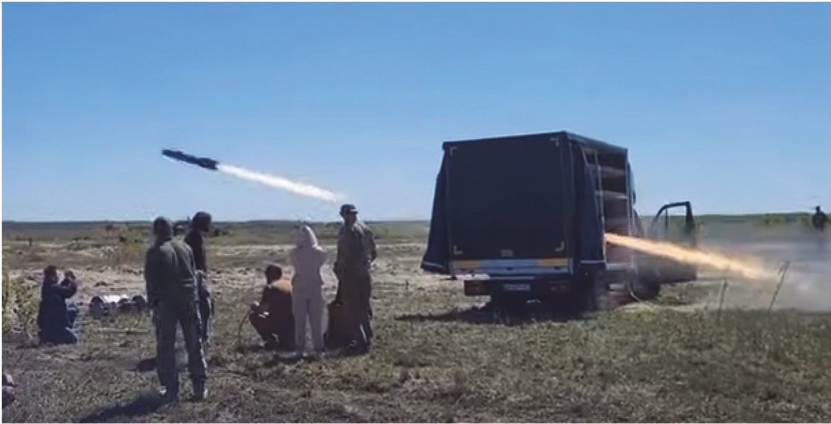
Ukrainian military uses low-tonnage trucks to launch Brimstone missiles

No cases of Brimstone missiles being used by the Ukrainian Armed Forces in violation of international humanitarian law have been recorded by Western intelligence, media, or the civil society actors.