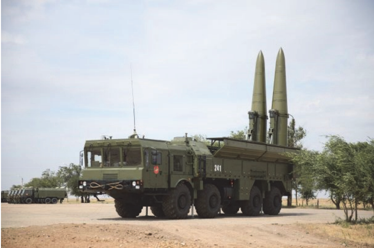
Iskander-M – 9K720 66

Because ballistic missile launchers are extremely similar to cruise missile launchers (which violate the treaty), this makes it difficult to track cruise missile launchers, and under the terms of the treaty, all Iskander-M launchers should be considered as violating the Intermediate-Range Nuclear Forces Treaty 65 .